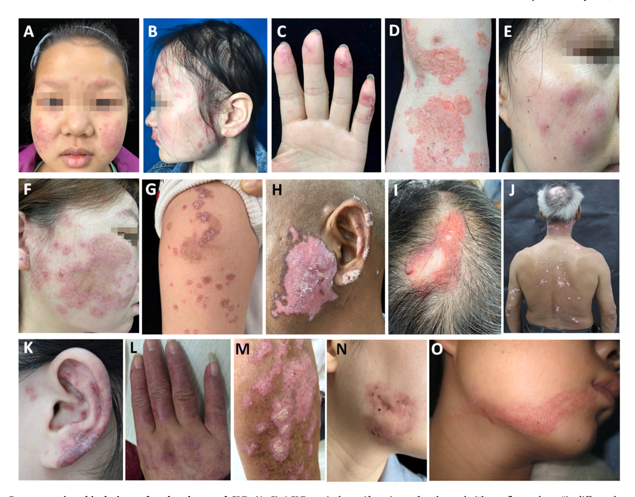
Fig. 2. Representative skin lesions of each subtype of CLE. (A–C) ACLE: typical manifestations of malar rash ("butterfly erythema"), diffuse alopecia and vasculitis of fingers, respectively. (D) BSLE: characterized by blisters and bullae on the erythema, which involve widespread area including the head, neck, trunk and limbs. (E) ICLE (also called LET): discrete, nonscaly, erythematous plaques or nodular skin lesions mainly involving sun-exposed areas (especially the face, the lateral and posterior neck, upper trunk and extensor surfaces of the arms). (F,G) SCLE: the annular subtype (F) and the papulosquamous or psoriasiform subtype (G), respectively, both of which mainly involves the sun-exposed area. (H,I) DLE: discoid erythematous plaques with firmly adherent scales/crusts, central atrophy and scarring, with hypopigmentation and hyperpigmentation, whose predilection sites include the face, auricle, and scalp, respectively. DLE of the scalp often leads to scarring alopecia. (J) DDLE: DLE lesions involving not only the head and neck, but also the trunk and upper limbs. (K,L) CHLE: chilblain-like edematous erythema or puffy nodules that can evolve into central erosion or ulceration sometimes, mainly involving cold-exposed acral areas (fingers, toes, heels, ears and nose). (M) VLE: DLE-like skin lesion(s) characterized by verrucous hyperplasia of the epidermis. (N) LEP: tender, indurated, erythematous plaques or deep nodules that can evolve into ulceration, disfiguring atrophy and scarring. (O) BLLE: a DLE-like, linear plaque of the skin along the Blaschko line. Abbreviations: CLE, cutaneous lupus erythematosus. ACLE, acute CLE. BSLE, bullous systemic lupus erythematosus. ICLE, intermittent CLE. LET, lupus erythematosus tumidus. SCLE, subacute CLE. DLE, discoid lupus erythematosus. DDLE, disseminated DLE. CHLE, chilblain lupus erythematosus. VLE, verrucous lupus erythematosus. LEP, lupus erythematosus. LEP, lupus erythematosus. DLE, libral supplementations.

anti-double strand DNA (dsDNA), anti-Sm and other anti-extractable nuclear antigen antibodies, and laboratory tests of complete blood count, urinalysis, urine protein to creatinine ratio, erythrocyte sedimentation rate and complements 3 and 4, are necessary. A newly identified epigenetic biomarker, IFI44L gene promoter demethylation in whole blood cell samples, has shown both a high sensitivity and a high specificity (both above 90%) for the diagnosis of SLE [13]. Detected by high-resolution melting-quantitative polymerase chain reaction (HRM-qPCR) assay, this IFI44L methylation biomarker can be a poten-tial laboratory test to help distinguish SLE from DLE, with a sensitivity of 96.00%, a specificity of 72.55%, a positive predictive value of 77.42% and a negative predictive value of 94.87%, when 25% methylation is defined as the cutoff value [14].